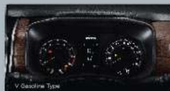
V Gasoline Type

Feel the wonderful journey created by the enhanced Full Dashboard with a two-tone colour design and luxurious Soft Pad.