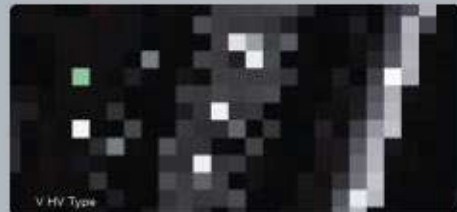
V HV Type

Enhance the majestic experience on every side as the new rear lamp is designed with modern details to accompany your greatest journey.