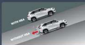
HILL START ASSIST (All Type)

Ensured protection by enduring impacts to minimize the chance of injury.