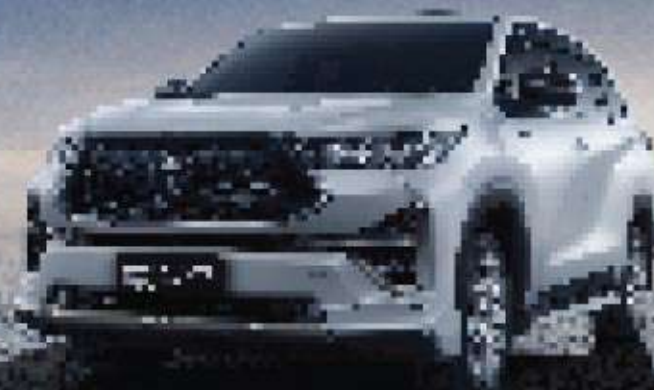
Q HV Modellista Type*