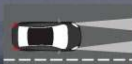
AUTOMATIC HIGH BEAM (AHB)

Supports and assists the driver in avoiding unintended lane departure with visual and audible alerts as The Lane Tracing Assist will reduce drivers burden by the steering assist for the car always on the center of the lane.