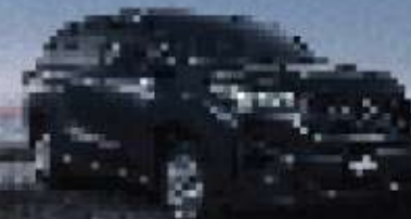
G HV Type