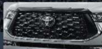
NEW GRILLE ORNAMENT MODELLISTA (Q HV & V HV Modellista Type)

Roam effortlessly as The All-New King Innova Zenix is completed with voice command technology to assist you in opening and closing the back door by the slight of your voice.