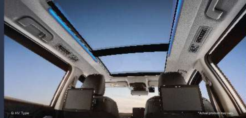
Q HV Type

Enhanced curve voice of the leather material embedded in every spacious seat.