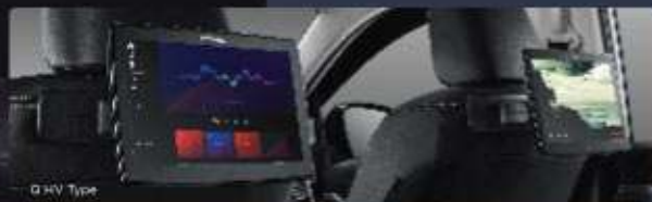
Q HV Type

Comes with an Electric Reclined Seat and New Leg Rest, bringing all kinds of ease in every distinguished journey ahead. It provides a sense of convenience when crossing over with The All-New Kijang Innova Zenix.