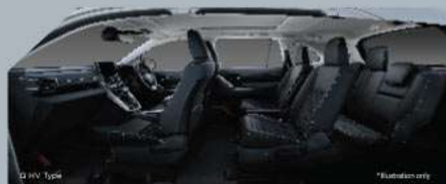
Q HV Type

*Also Available without RSE in V Gasoline Type.