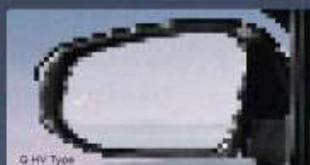
BLIND SPOT MONITOR (BSM) (All Q HV Type)

Prevents the risk of wheel slip by reducing power and applying brake force.