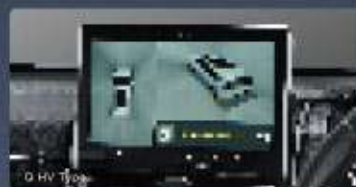
PANORAMIC VIEW MONITOR (All Q HV Type)

Prevents the vehicle from rolling back on steep hills.