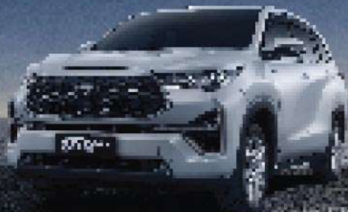
Q HV Type