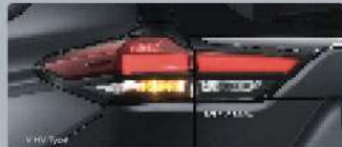
V HV Type

Boost your crossing journey with the captivating silver-painted 16" Alloy Wheel.