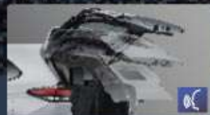
NEW POWER BACKDOOR WITH VOICE COMMAND (All Q HV Type)

The greater diameter of the tire comes up with a picture-perfect design in a super chrome painting to take you on a grand journey ahead.