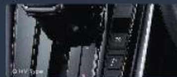
Q HV Type

Control all entertainment through Bluetooth, Wi-Fi, and Voice Recognition or navigate your daily life easier with smartphone connectivity and NFC E-Toll Card Checking (e-Money & Flazz) for your comfortable journey.