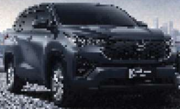
V HV Type