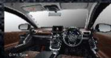
G HV Type

Altering an advanced system, it creates flawless combustion, achieves dynamic performance, and more efficient fuel consumption for a fascinating journey.