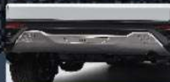
NEW REAR BUMPER SPOILER MODELLISTA (Q HV & V HV Modellista Type)

Brings a remarkable elegant look to the side body and prevents the refinement from having any damage when the doors are closed.