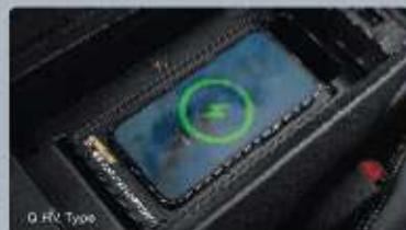
Q HV Type

The rigidity form and equal comfort in all seat rows are perfectly emphasized by the more spacious cabin for the 2nd and 3rd rows, along with the light feel and the driving stability that is created by the finer suspension.