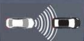
DYNAMIC RADAR CRUISE CONTROL (DRCC)

An integrated radar system that helps to reduce crash risk and damage in a frontal collision.