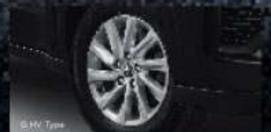
G HV Type