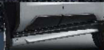
NEW SIDE BODY MOULDING WITH SIDE SKIRT MODELLISTA (Q HV & V HV Modellista Type)

Capture the dignified feeling on your journey with Front Bumper Spoiler's look with Modellista artistry.