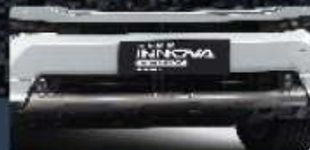
NEW FRONT BUMPER SPOILER MODELLISTA (Q HV & V HV Modellista Type)

The vigorous design Front Grille is enhanced by the side & upper Modellista ornament (available as TCO) that applies to create a majestic presence.