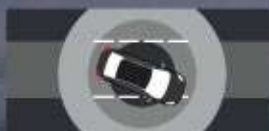
LANE DEPARTURE ALERT (LDA) & LANE TRACING ASSIST (LTA)

Detects a preceding vehicle and follows within a safe distance to reduce the fatigue of long driving.