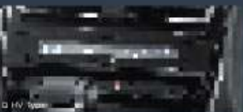
Q HV Type

Embedded with convenience lamp covered on the black premium leather material will bring a pleasant experience in every voyage.