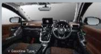
V Gasoline Type

Allure every eye as the remarkable silver-painted 17" Alloy Wheel design is injected for a striking look on road.