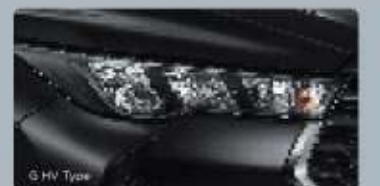
G HV Type

The enormous entertainment bundle is injected with the Smartphone Connectivity function and NPC for checking e-Toll card (e-Money & Plaza) to deliver your convenience in every journey.