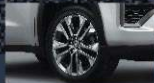
NEW FASCINATING 18" ALLOY WHEEL (All Q HV Type)

Expense your delicate driving moment with the new Front Grille design where the LED Headlamp (All Type), DRL & Foglamp (Q HV Type) made flawlessly to make every head turn for your greater journey.