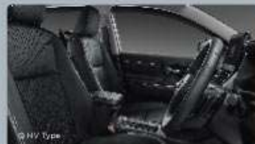
Q HV Type

Connect freely to the outside world with the Wireless Charger to power up your devices.