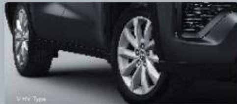
V HV Type

Choose what you desired by switching to Eco mode for a smooth driving experience, Power mode for maximum engine power, and EV Mode to go with full electric power to reduce fuel consumption.