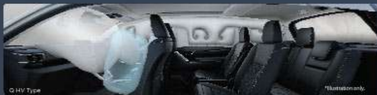
6 SRS AIRBAGS (All Q HV Type)

Ensured protection by enduring impacts to minimize the chance of injury.