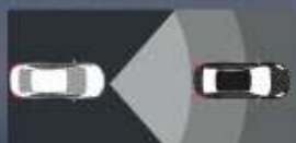
PRE-COLLISION SYSTEM (PCS)

The first-class Toyota innovative safety feature protects and prevents passengers from any harm for serenity in every mile.