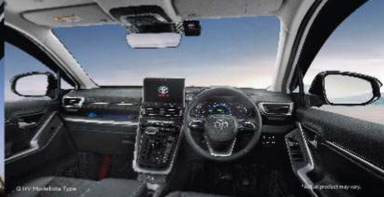
Q HV Model only

An entire digital instrument to provide and convey essential information about your vehicle.