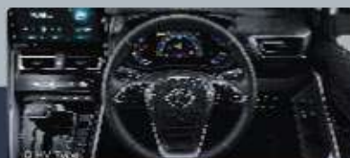
Q HV Type

Begin your wonderful journey with just a simple touch as the parking brake is now installed with electric functionality.