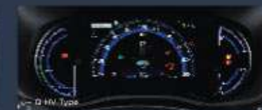
Q HV Type

Lighter Steering Wheel with better stability and power to control every road you thrive with ease as the Paddle Shift is injected.