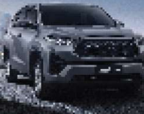
V Gasoline Type