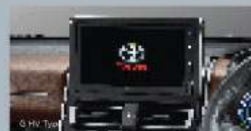
G HV Type

An engaging visual to keep you enlightened for the essential information on the road.