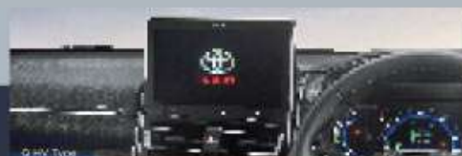
Q HV Type

Reels every exquisite driving moment with the wide form of the Panoramic Roof and ignites the night with Illumination Lights (All Q HV & All V Type) to grant you greater views.