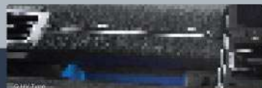
Q HV Type

The exhilarated journey is guaranteed by the dynamic yet modern design interior as the premium made Soft Pad (All Q HV & All V Type) and Black Leather Seats give a sense of luxury and sophistication.