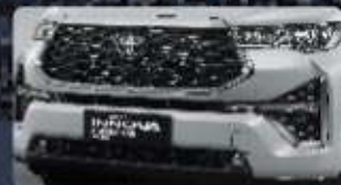
NEW CROSSOVER FRONT LOOKS (All Type)

Comes with 8 years/160,000 km lifespan battery warranty covered by Toyota to bring your journey without worry.