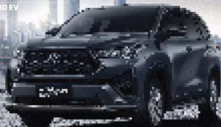
V HV Modellista Type