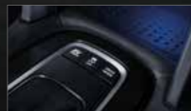
Advanced Drive Mode. Enjoy the journey as you experience ECO, Sport or EV. (HV Type)