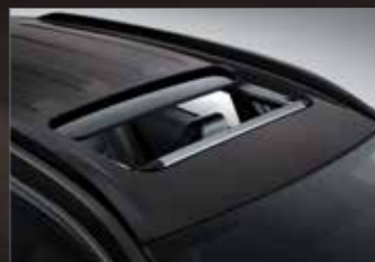
Power Moonroof. Providing sufficient lighting in the cabin to give a spacious feeling. (All Type)