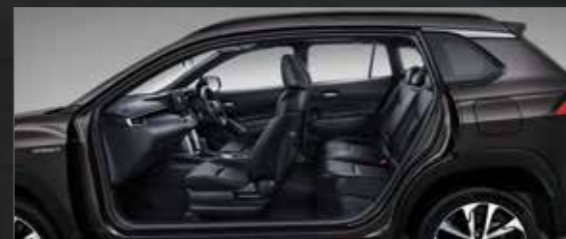
Comfortable Cabin Space Designed and calculated flawlessly to give a decent leg room and high ceiling for an enjoyable driving experience. (All Type)