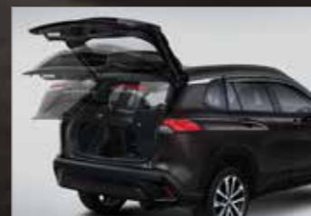
Automatic Power Back Door. Equipped with kick sensor feature to make it more convenient when loading into the trunk. (HV Type)

Hybrid engine and battery power work seamlessly to enhance a smooth driving experience and maximum performance to let you conquer every journey.