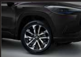
18" Alloy Wheel. New design with machining and dark grey chrome color providing a more urban look. (All Type)