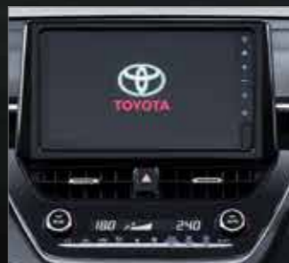
Multi-Purpose Head Unit. New 9" Display with AM/FM Stereo, Bluetooth, Miracast, NFC and Voice Command.