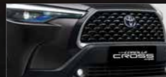
Bold Front Grille Design. With double trapezoid shape on the grille to highlight the toughness element of the car. (All Type)