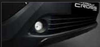
Beaming LED Foglamp. Giving a solid visibility for a comfortable and safe driving experience. (All Type)