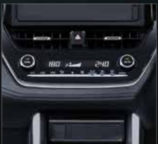
Dual Zone With Auto Function Convenient AC adjustment as the driver and passengers preferences. (All Type)