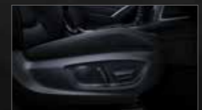
Electric Power Seat. An easy 6-way position adjuster for the driver to aim for the best convenient position. (HV Type)