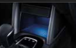
Illuminating Console. Not only providing a luxurious addition to the interior but also giving better visibility to the center console. (All Type)