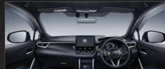
Classy Interior Design With elegant black color and silver chrome details placed meticulously to further enhance the luxurious feeling on the inside of the car. (All Type)