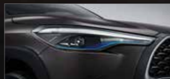
Sharp Headlamp Design. Enhancing the sleek yet premium look of the front part of the car. (HV Type)