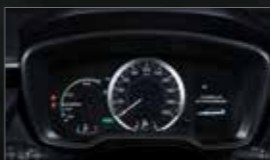
Detailed MID and Combi Meter Design. With digital MID for a more comprehensive outlook on the vehicle's status. (HV Type)