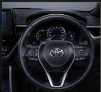
Elegant Steering Wheel Design. Embellished with silver chrome details to give a more prestigious experience when commanding the road. (All Type)